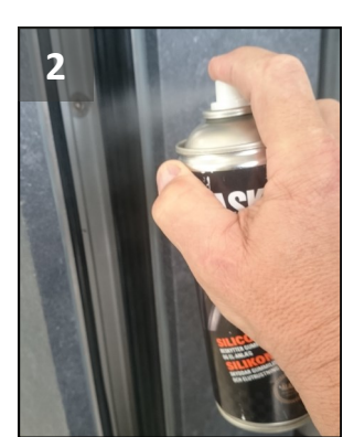
Lubricate the sealing strips in the base profiles with good quality silicone before installing beams