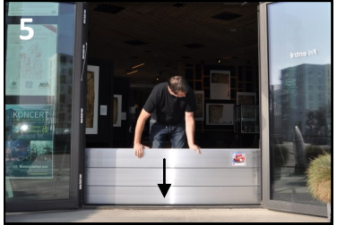
The beams must be pressed together and down towards the floor so that the bottom seal can absorb unevenness in the floor