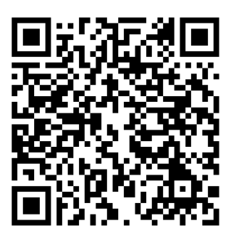
Scan the OR code and see the use of the paint roller handle